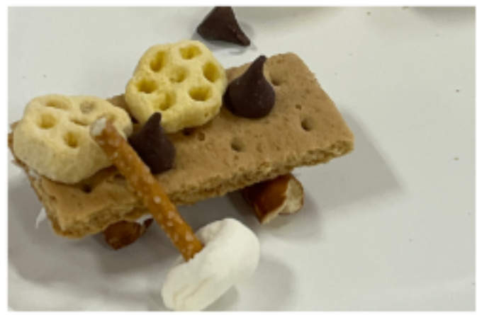
Work Table & Hammer