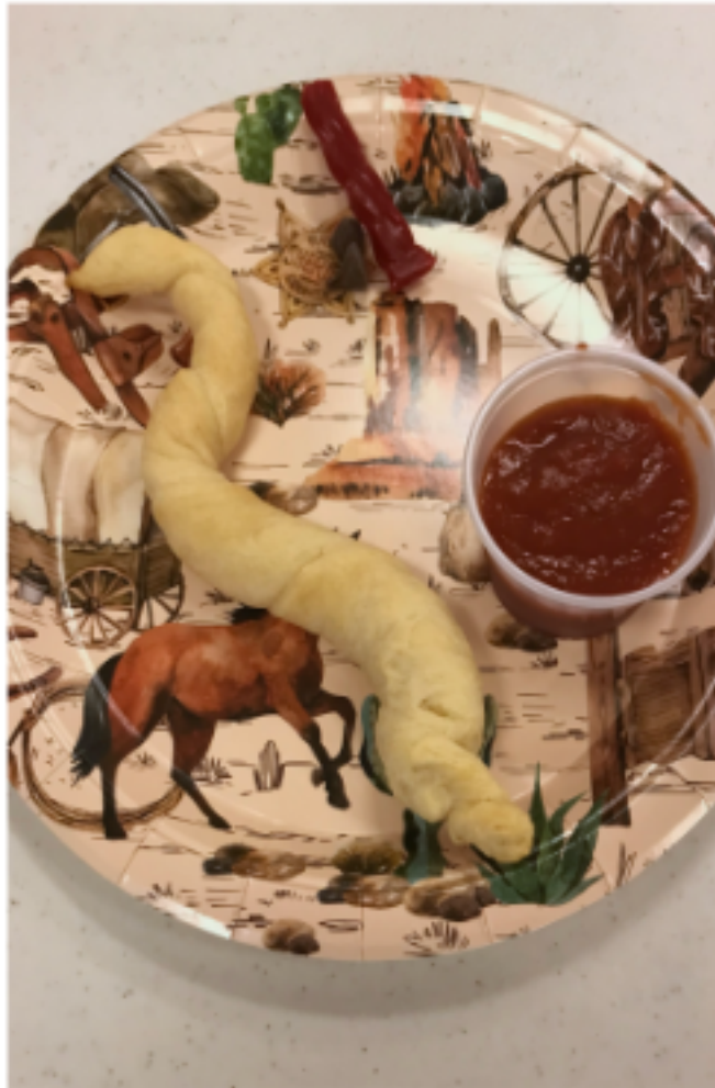
Snake / Serpent